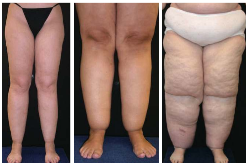
Figure 1. Mild (left) moderate (centre) and severe (right) lipoedema