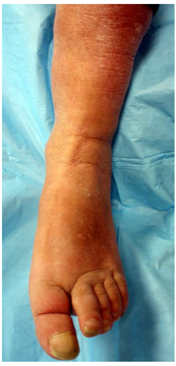
eFigure B. Pretibial myxedema causing a peau d'orange appearance in a patient with Graves disease.