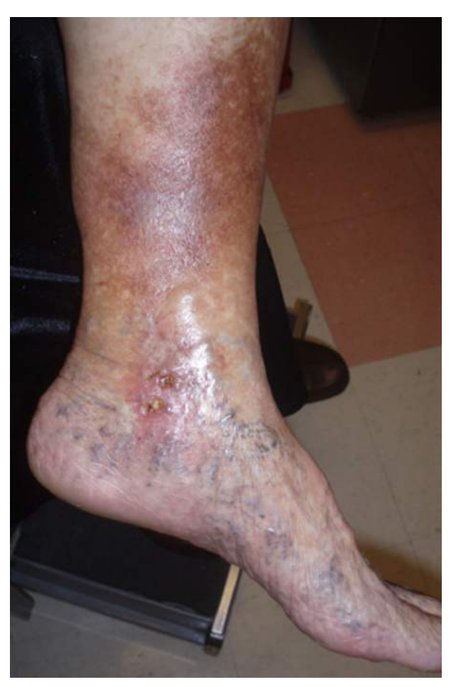
eFigure A. Venous insufficiency with venous stasis ulcer over the medial malleolus. Note the yellow-brown hemosiderin deposition.