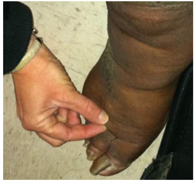
eFigure D. Failure to tent the skin overlying the dorsum of the second toe using a pincer grasp (Kaposi-Stemmer sign) in a patient with lymphedema.