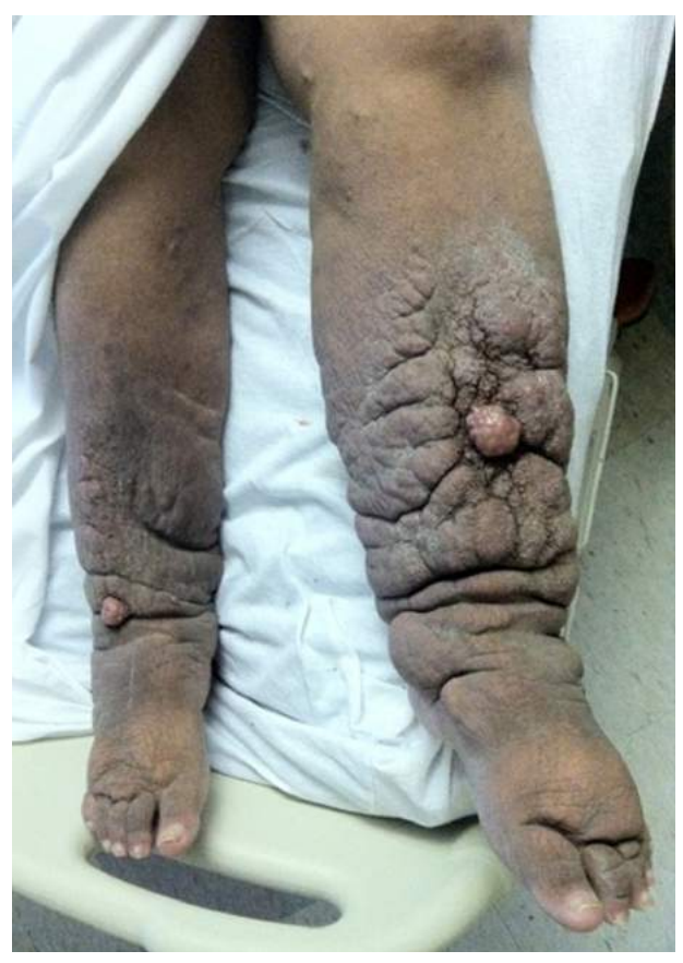
eFigure C. Long-standing lymphedema with thickened, verrucous skin.