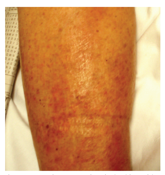
Figure 4. Acute deep venous thrombosis with overlying cellulitis.

elevation and compression stockings with 20 to 30 mm Hg for mild edema and 30 to 40 mm Hg for severe edema complicated by ulceration, are recommended.<sup>1,4,5,8,29</sup> Compression therapy is contraindicated in patients with peripheral arterial disease. A study of 120 patients with