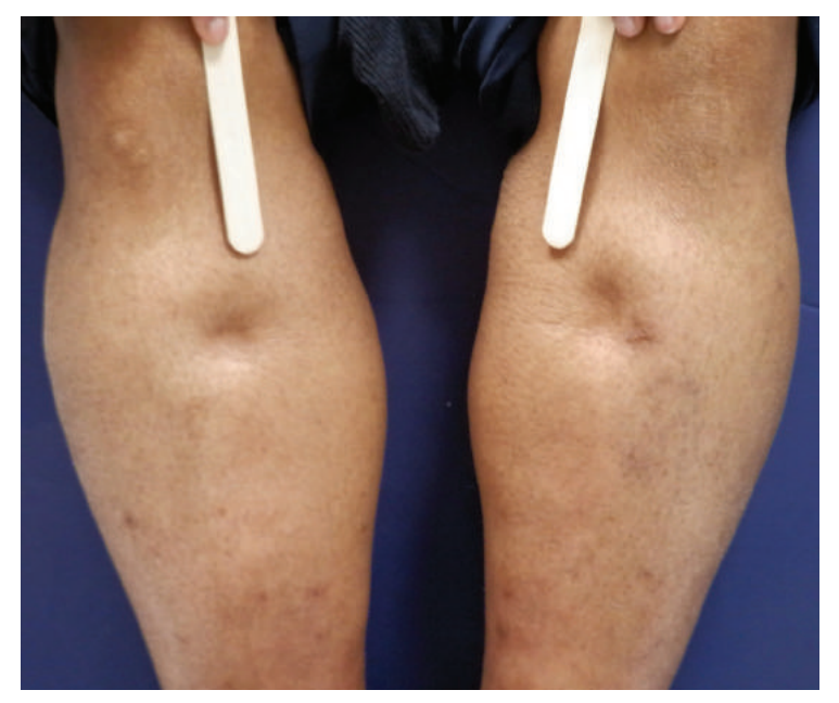
Figure 3. Pitting edema, bilateral, as observed in a patient with congestive heart failure.

channels, is the method of choice for evaluating lymphedema when the diagnosis cannot be made clinically.<sup>11,21</sup>