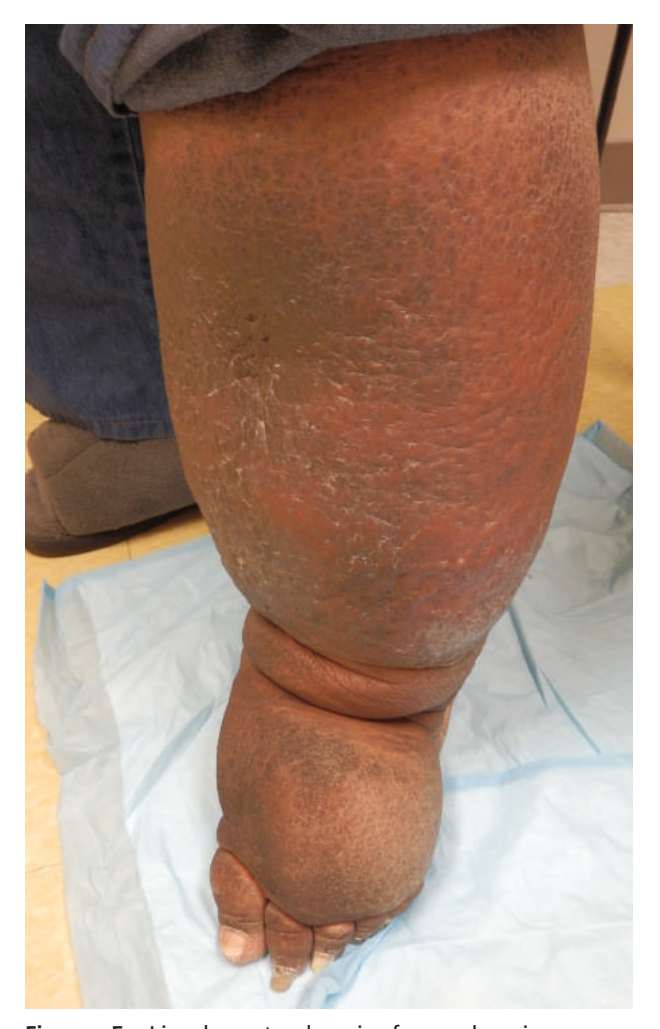
Figure 5. Lipodermatosclerosis from chronic venous insufficiency associated with marked sclerotic and hyperpigmented tissue.

Mixed evidence exists for the use of pneumatic compression devices in patients with chronic venous insufficiency.<sup>29,32</sup> However, these devices should be considered for patients in whom compression stockings are contraindicated. For mild to moderate chronic venous insufficiency, oral horse chestnut seed extract may be an alternative or adjunctive treatment to compression therapy.<sup>33,34</sup>