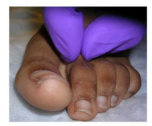
Fig 3. Assessing Stemmer's sign. A positive Stemmer's sign is a skin fold at the base of the second toe too thick to lift. In this image, Stemmer's sign is negative because the skin lifts normally when pinched.

Although long-term low-level compression therapy is unlikely to reverse lipedema, it may help prevent its worsening and progression to lipolymph-