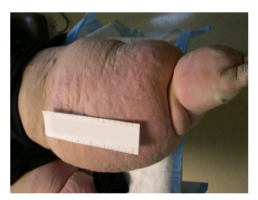
Fig 1. Massively enlarged lower extremity with firm subcutaneous fatty nodules but little epidermal change.

*Features of both lipedema and lymphedema may be present in patients with lipolymphedema.