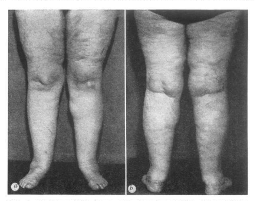
Fig. 1. Lipedema of the lower extremities of a woman aged 48 years. a. Anterior view. b. Posterior view.

enlarged owing to the subcutaneous deposition of fat. The feet are ordinarily normal in size and configuration (figure 2). There is moderate to great sensitiveness to digital pressure and, particularly at the end of the day, there may be some evidence of edema, although the evidence is not great enough to explain the patient's statement relative to the degree of swelling which has occurred as a result of orthostatic activity. The skin and subcutaneous fat are soft and pliable. There may be generalized obesity, but in most instances the upper parts of the body are "normal" in size and contour.